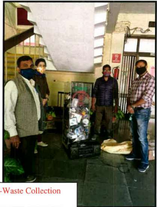
Fig 4.2 Emptying of E-Waste Collection Box