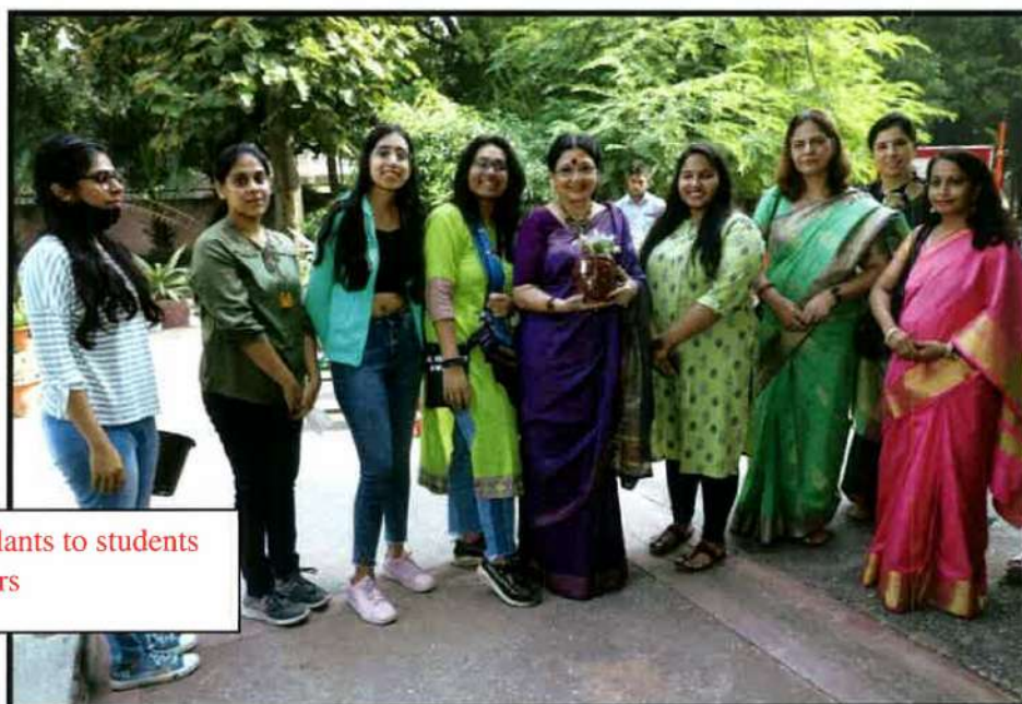
Fig 2.2 Selling of potted plants to students as well as the staff members

PRINCIPAL KAMALA NEHRU COLLEGE (University of Delhi) August Kranti Marg New Delhi-110049