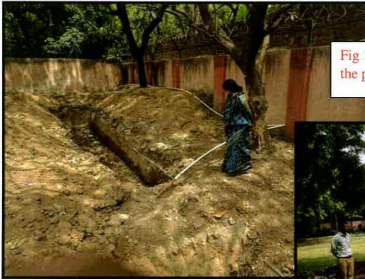
Fig 1.1 Green Plantation on the ridges of the pit