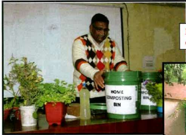
Fig. 2 Workshop on Converting kitchen waste to organic compost