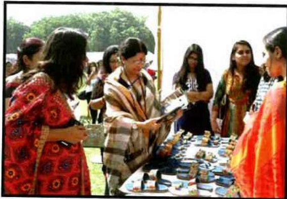
Fig 5.2 Project Kadam for making slippers from denim

[Signature] PRINCIPAL KAMALA NEHRU COLLEGE (University of Delhi) August Kranti Marg New Delhi-110049