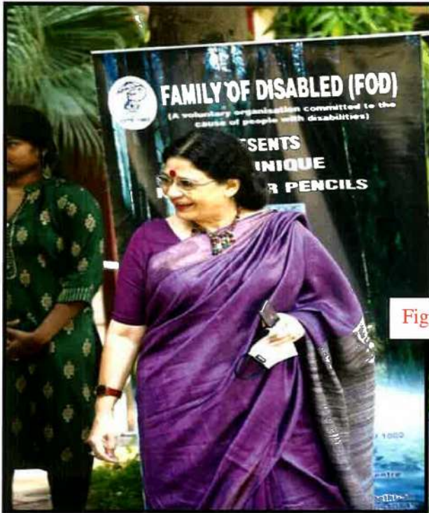
Fig 5.1 Newspaper pencil with FOD