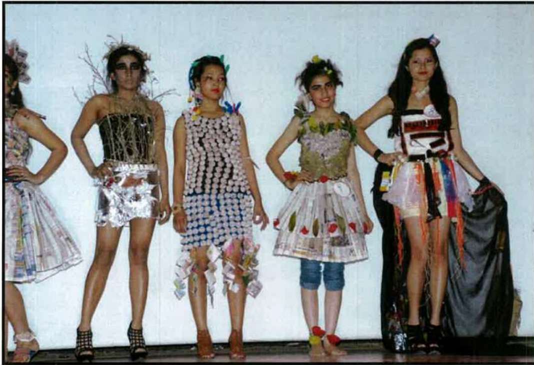
Fig 5.3 Costume making from Newspaper waste