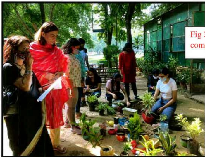
Fig 2.1 Vertical Gardening using organic compost made from solid waste

कमलानेहरूकॉलेज (दिल्लीविश्वविद्यालय) रा. मू. एंव.प्र. प. द्वारा 'ए' श्रेणीप्रत्यायित अगस्तक्रांतिमार्ग, नईदिल्ली-110049 दूरभाष: 011-26494881, टेलीफैक्स: 011- 26495964 ई-मेल: kamla.nehru_du@hotmail.com