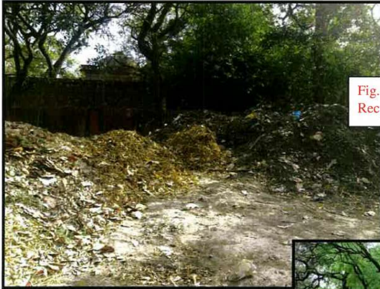
Fig. 1 Segregation of Organic and Recyclable Waste