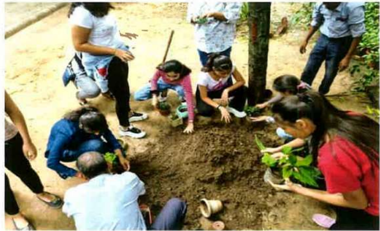
Figure 3 Haryali Project