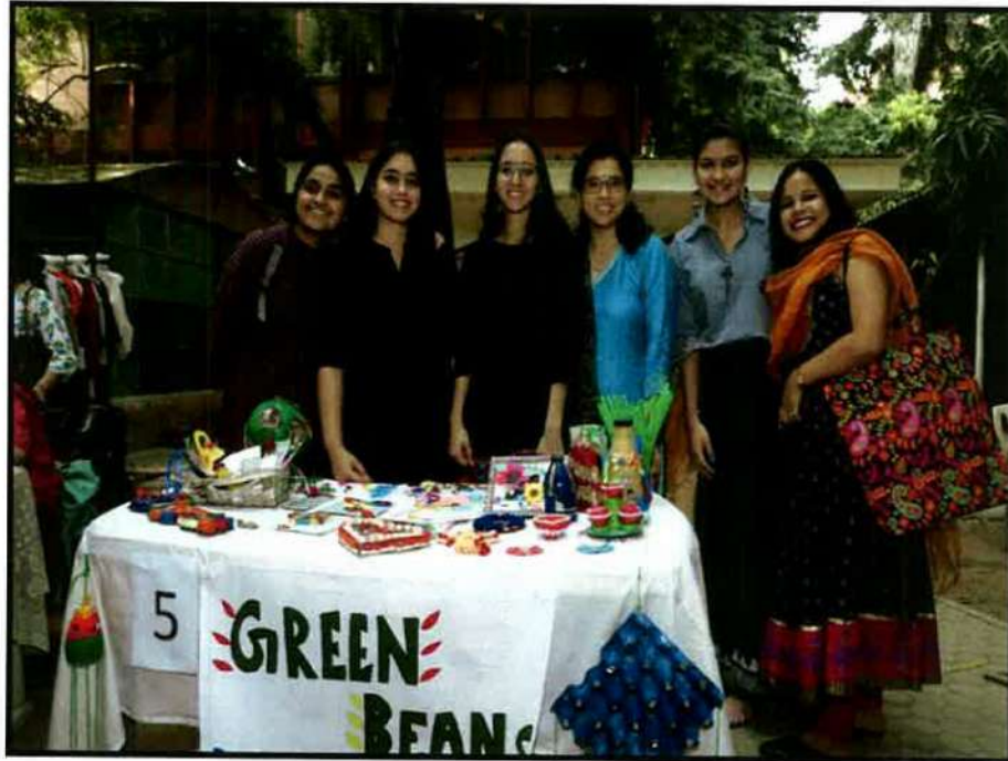
Figure 6 Activities organized by Green Beans- the environment club, KNC